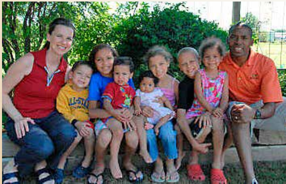
The Dunford Family