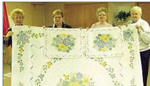
The German Feast and Auction in Corn on February 4 features handmade quilts, above, authentic German food, farm supplies, crafts and more.

To take advantage of the new benefits, co-op members will need to show their providers a new card. Until new plastic cards can be issued, members are urged to download the new Healthy Savings discount card at http://www.nbdrugcard.com/touchstone/ .